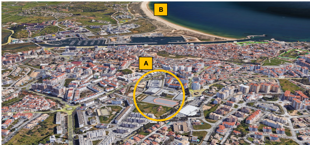
Aerial view of Lagos City